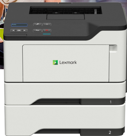
B2442dw with optional tray