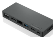
Lenovo USB-C Travel Hub